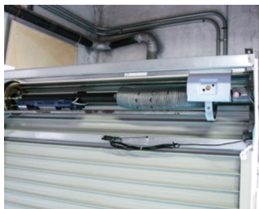
Coil spring for shutters