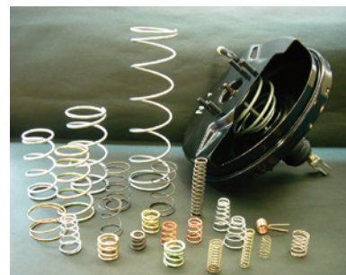
Various types of springs