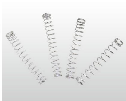
Small diameter springs

〈 Hard drawn steel wire with a small diameter 〉 • JIS G-3521 hard drawn steel wire • Product type : SW-A, SW-B, and SW-C • JIS authentication number : QA0307068