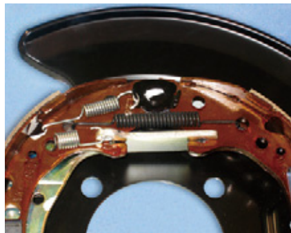
Return spring for drum brakes